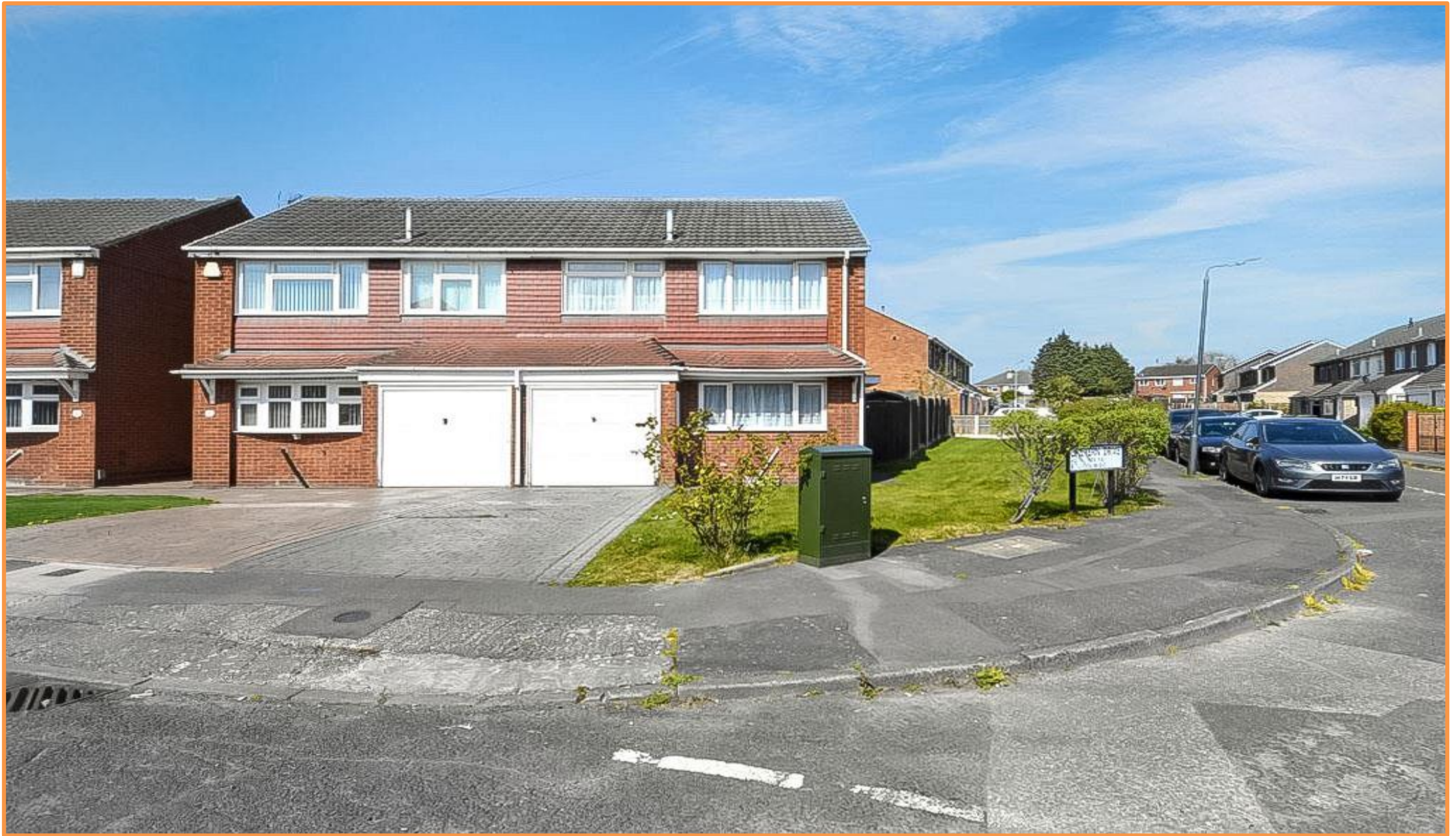
Chiltern Drive, Willenhall, WV13 3QL